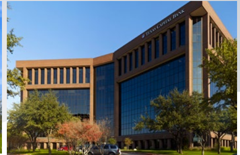
Texas Capital Bank

Richardson has been a popular location for insurance, banking and other financial services companies since the 1980s when the first major wave of multi-story office buildings were built.