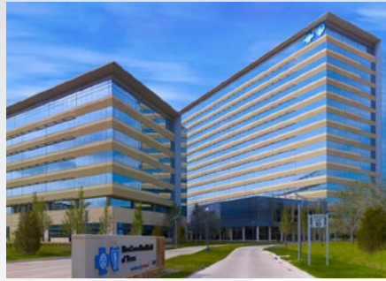
BlueCross BlueShield of Texas